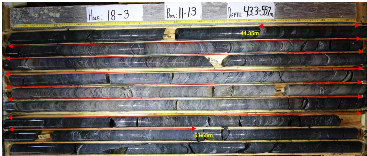
Image Description: Image of core run for hole 18-03 showing intersection of North Zone between 44.35 and 53.55 meters down the hole. See description above. Photo taken on site at Lingman Lake mine, September 8 th , 2018. The drill hole pierced the North Zone about 10 to 16 meters below the 150 Level drift (46-meter depth, east-west underground tunnel) of the mine. The intercept is below a 41-meter length of this drift, which historical records indicate averaged 15.4 grams of gold per tonne.

64.47 - 77.23 (12.76-meter length); very chloritic with pervasive carbonate and brecciated appearance with 5% pyrite in upper <1 meter of the intersection.